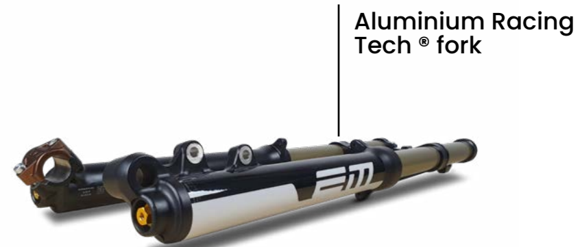
Aluminium Racing Tech® fork