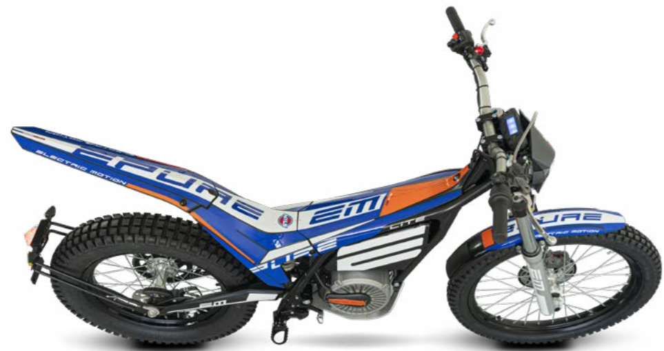
Black mat frame.