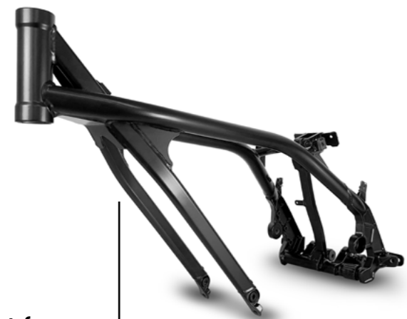
Black mat frame.