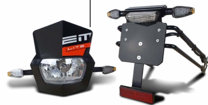
Road legal kit (125cc).