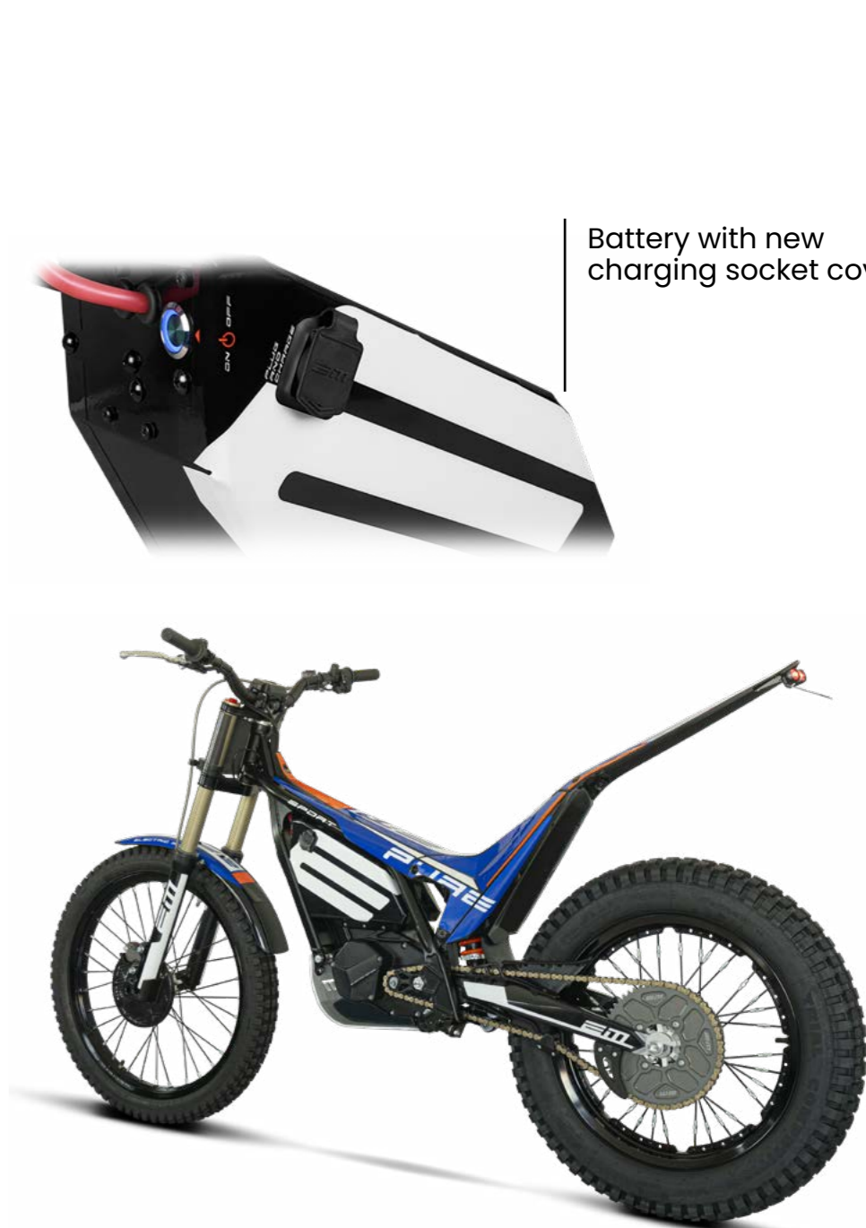
Battery with new charging socket cover.