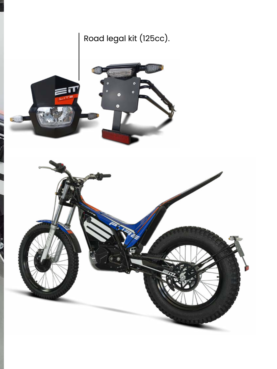
Road legal kit (125cc).