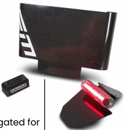
LED kit : not homologated for road use (option).