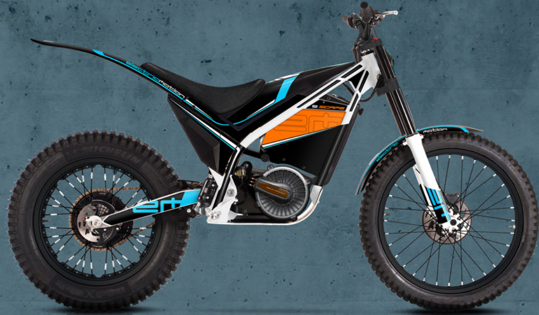
e SCAPE SPORT