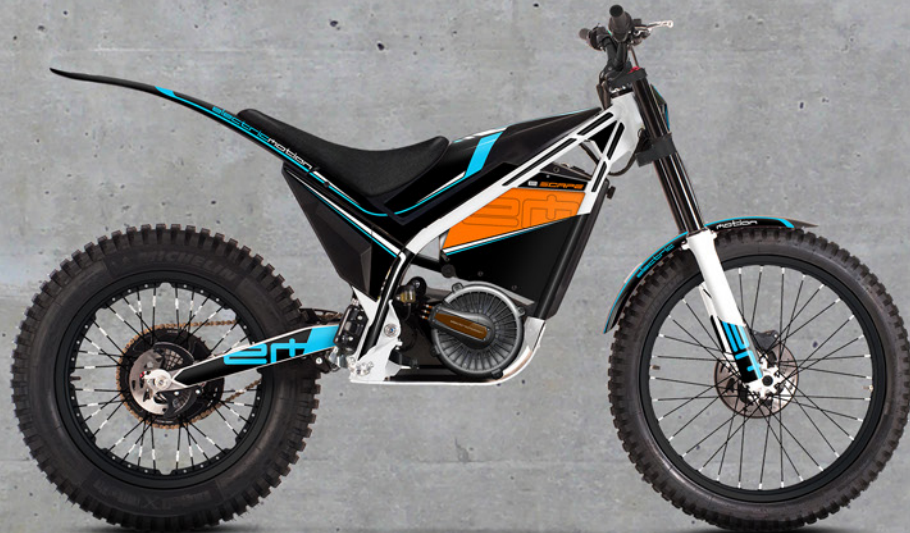
e ESCAPE SPORT