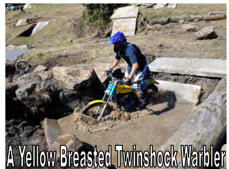
A Yellow Breasted Twinshock Warbler