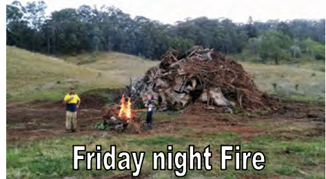
Friday night Fire