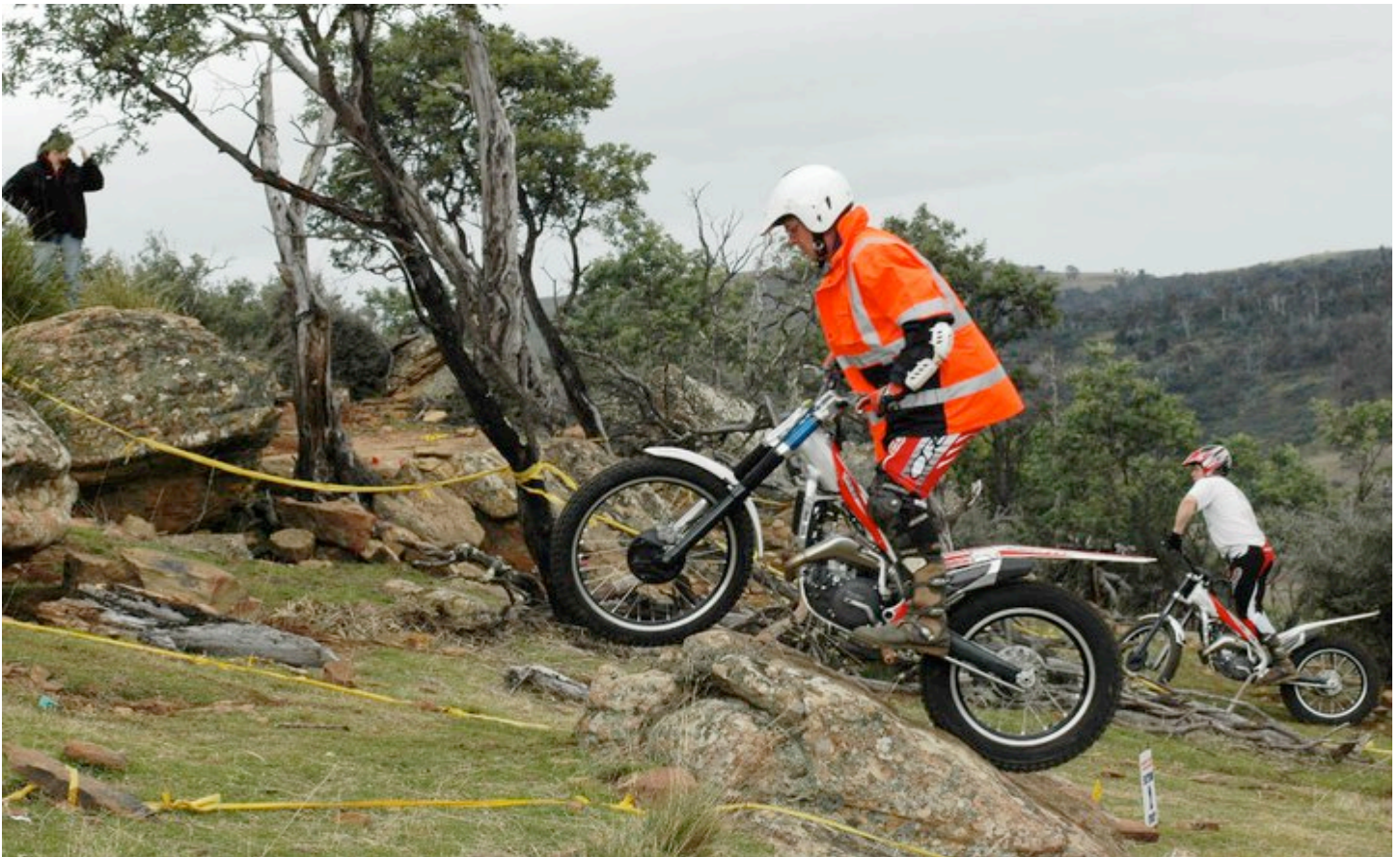
Some moments Mt Joy and Jericho Trials